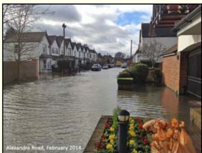
Alexandra Road, February 2012

TD Flood Resilience conference organised by RA's Flooding Group